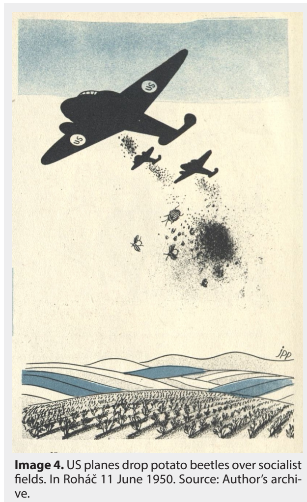
Image 4. US planes drop potato beetles over socialist fields. In Roháč 11 June 1950.

In addition to printed news, the scandal of the “American Beetle” was also communicated to the general public in Czechoslovakia through leaflets and documentary films. Aside from the illustrated agitprop for children, O zlém brouku bramborouku (1950)