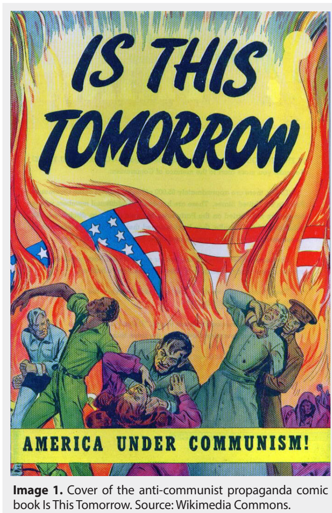
Image 1. Cover of the anti-communist propaganda comic book Is This Tomorrow .

One such anti-communist comic, published in 1947, is called Is This Tomorrow. America Under Communism! 10